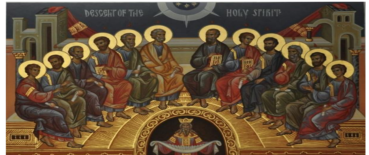
First United Presbyterian will observe the Pentecost Offering on June 9, 2019